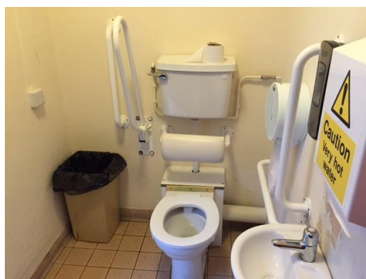
Above: Castle Hill accessible toilet