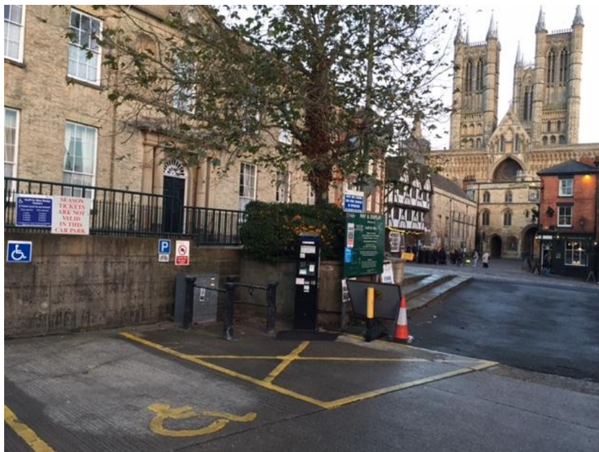
Above: Castle Hill, Disabled Parking Bay