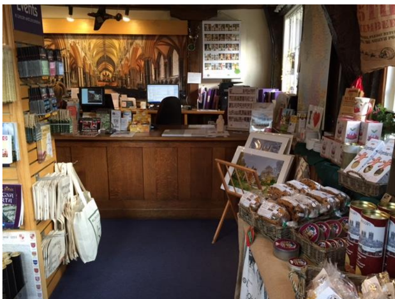
Above: Customer Advisor Desk (view from the entrance)

Low level counter and a chair can be provided if required.