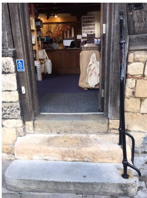
Above: The steps at the Visitor Information Centre main entrance.

Externally there are three steps (fitted with a hand rail to one side) to enter and exit the Visitor Information Centre. The highest step measures 180mm in depth the lowest step measures 150mm in depth. The entrance steps are limestone, which are uneven in places. The door has a clear opening width of 760mm.