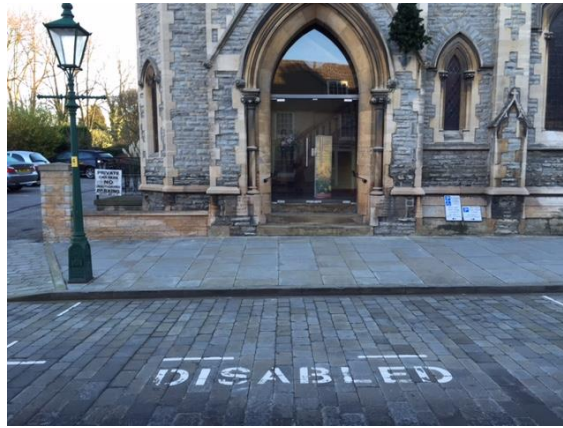
Above: Disabled parking bay by Bailgate Methodist Church