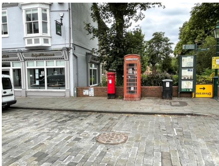
Above: Disabled parking bay by Elite on the Bail

There are two disabled parking bays on Bailgate, one by the Bailgate Methodist Church and one by Elite on the Bail (Fish and Chip restaurant & takeaway). (3 hours for Blue Badge holders) and several 1 hour parking spaces (all day parking for Blue Badge holders)