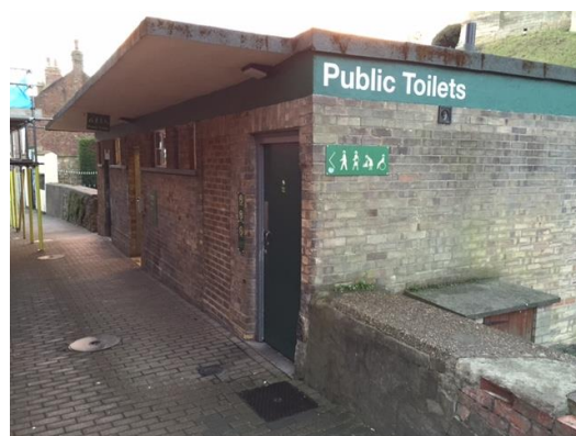
Above: Castle Hill accessible toilet