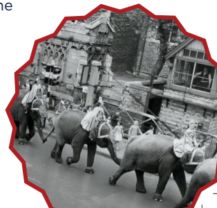
Billy Smart's circus parade down the High Street in 1955

18. St Mary Le Wigford is a church of Saxon origins with a stone tower believed to have been built in the 11 th century by a Viking named Eirtig. The church was probably built on the driest part of an area that was almost an island surrounded by the Witham and marshes. The church has survived wars and catastrophes in the centuries that followed, even growing in size and importance in the process.