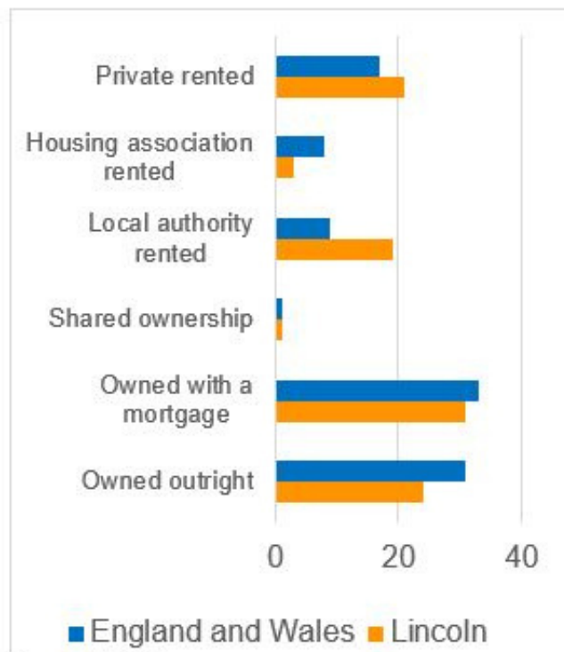
Figure 5 Percentage tenure split

1.12 With respect to housing tenure, as shown in Figure 5, the 2011 census shows that Lincoln has a lower proportion of owner occupiers, but higher proportions of those in social and private renting as compared with England and Wales.