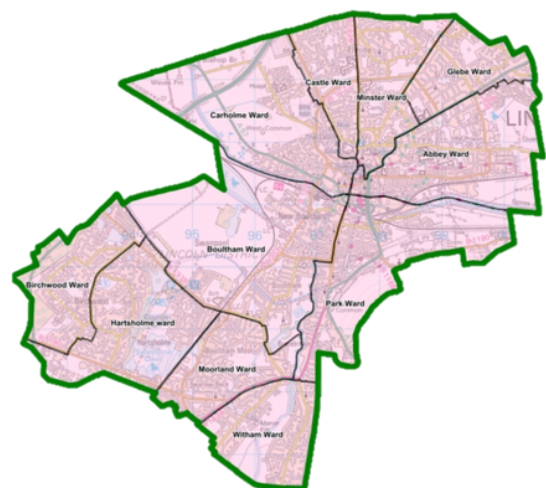
Figure 2: Ward map of Lincoln

1.6 The main concentration of deprivation is in the Park Ward – this being the Sincil Bank residential area of the City, which is mixed tenure. Other Wards, including Birchwood, Moorland, Castle and Glebe also contain LSOAs with deprivation levels in the worst 10% of the country.