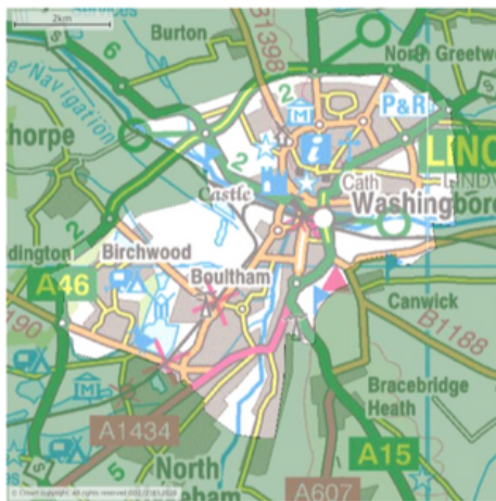
Figure 1: ONS map of the City

1.2 As a district council the City of Lincoln Council is both the Local Housing Authority and the Local Planning Authority, with Lincolnshire County Council having responsibility for social services and transport within the city.